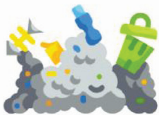
Plastic causes landpollution